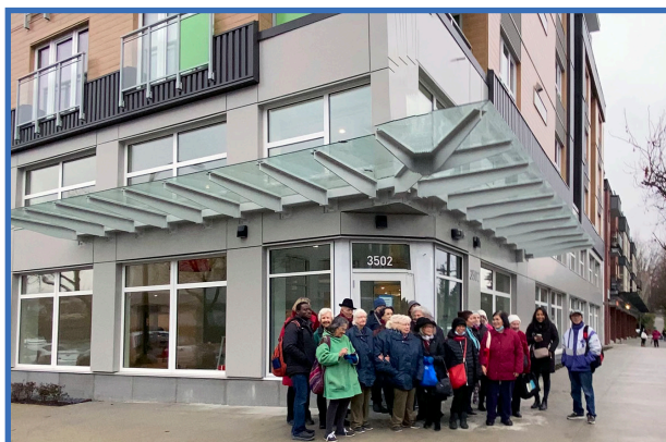
The new 411 premises on fraser street

The work of the 411 Seniors Centre is a collective effort of many people who volunteer their time and bring their knowledge, skills, and experience to better our community. On behalf (continued on page 3...)