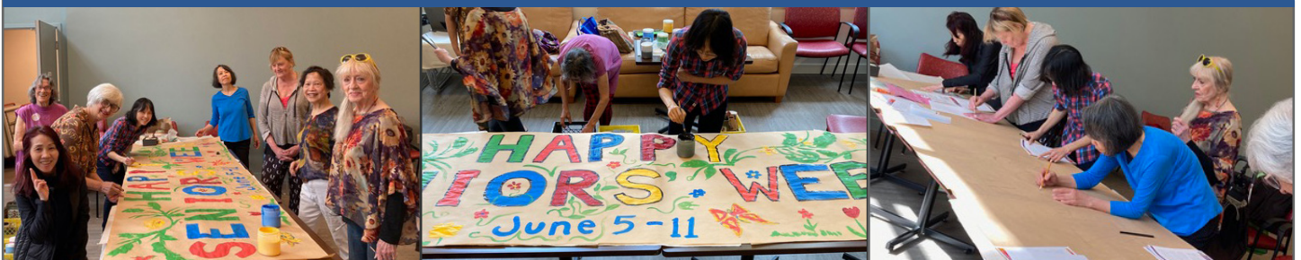
Art Students from the art class make a poster to hang for Seniors Week. It was great fun working together.

Membership fees, a mere $10/year - JOIN Now